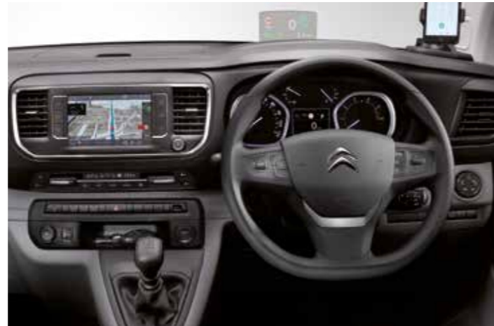
Height and adjustable steering wheel

9 Painted black with standard paint; painted black with Passion Red and special paint (with or without Look Pack); painted body colour with Look Pack (excluding Passion Red and special paint).