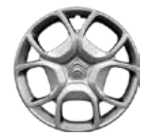
16 inch steel wheel full cover