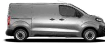
Cumulus Grey (M)