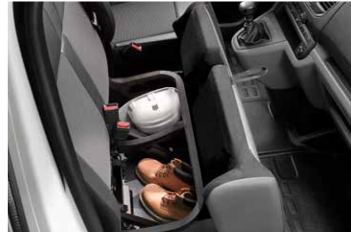
Storage tray under front passenger seats