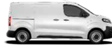
Polar White (F)