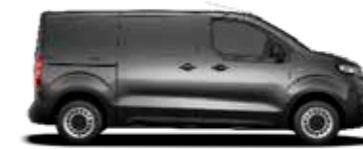
Platinum Grey (M)