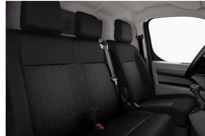
Height adjustable 3-point pre-tensioner seat belts