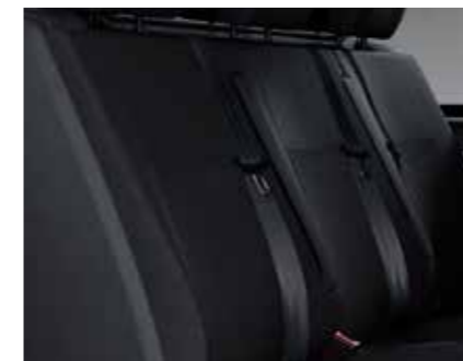
GREY 'MICA' CLOTH Standard on Crew Van and Platform Cab