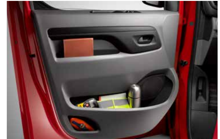
Front door pockets