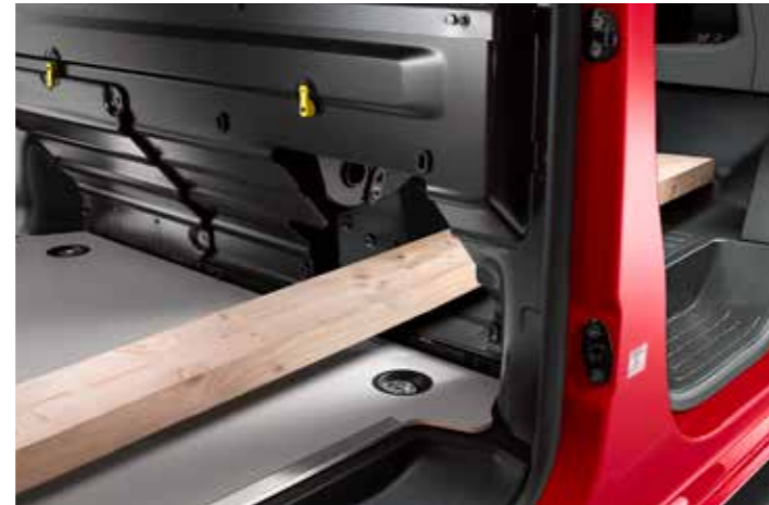
Full steel bulkhead with Moduwork® load-through flap