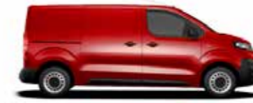
Passion Red (F)