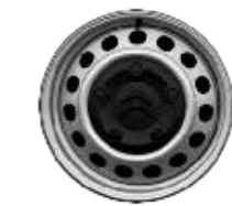
16 inch steel wheel with black centre cap