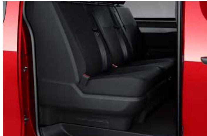
Twin sliding doors (not electric)