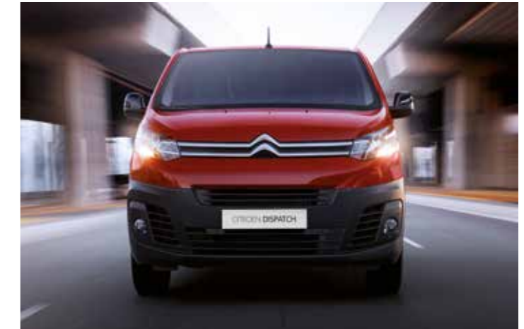
Headlights with integrated daytime running lights (DRLs)