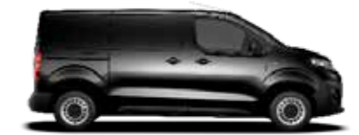
Perla Nera (M)